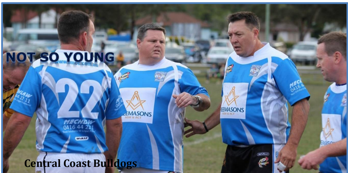
Central Coast Bulldogs