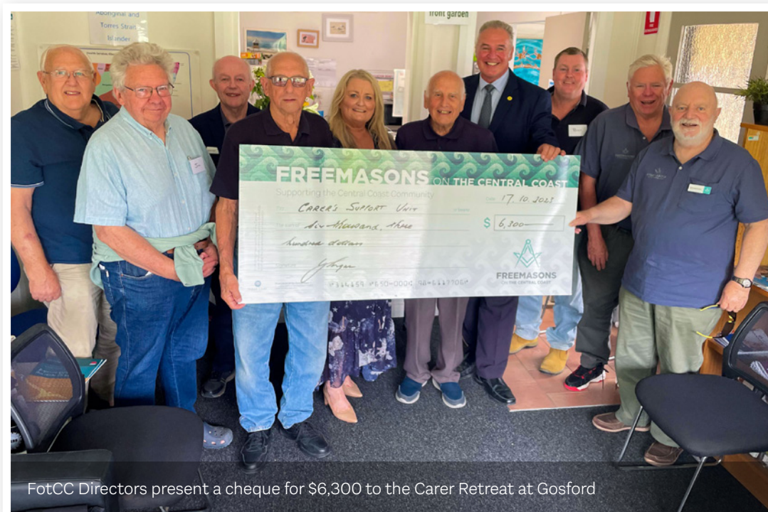
FotCC Directors present a cheque for $6,300 to the Carer Retreat at Gosford

Freemasons on the Central Coast (FotCC) were delighted recently to make a $6,300 donation enabling the purchase of a massage chair and garden furniture for the Carer Retreat at Gosford Hospital.